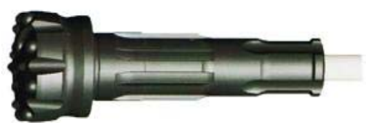
Specification Of Products:SD5