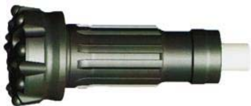
Specification Of Products:QL50