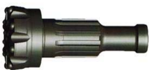
Specification Of Products:M50A