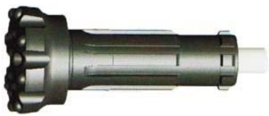
Specification Of Products:MD55 DHD350R COP54