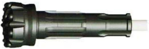
Specification Of Products:SD6