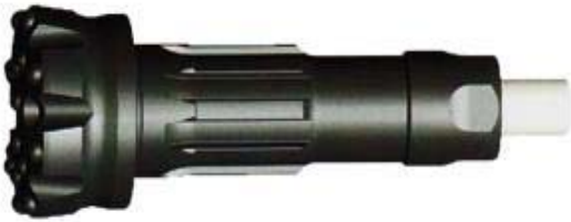
Specification Of Products:MD65 DHD360 COP64