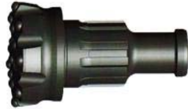
Specification Of Products:M60A